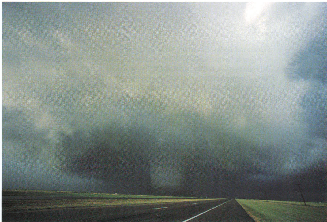
Wedge tornado near White Deer, Texas on May 29, 2001